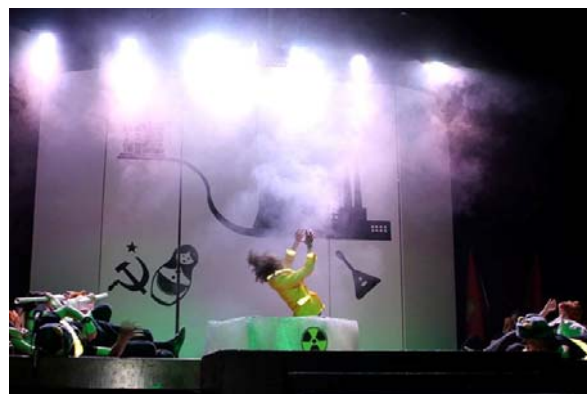
Atom Bear Splits the Atom!