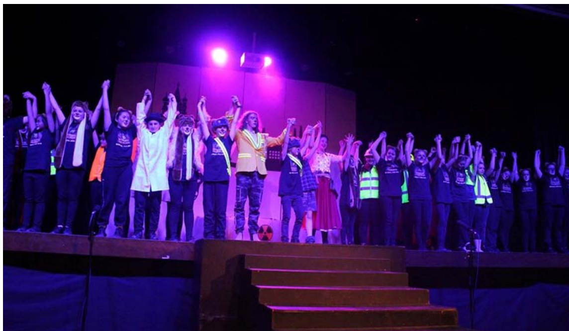
Atom Bear - Curtain Call