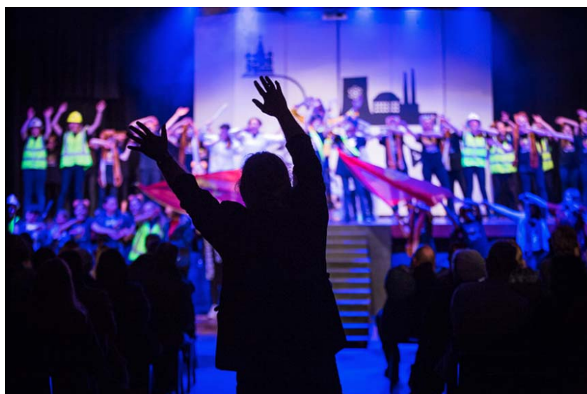
'Bear Revolution' Final Performance