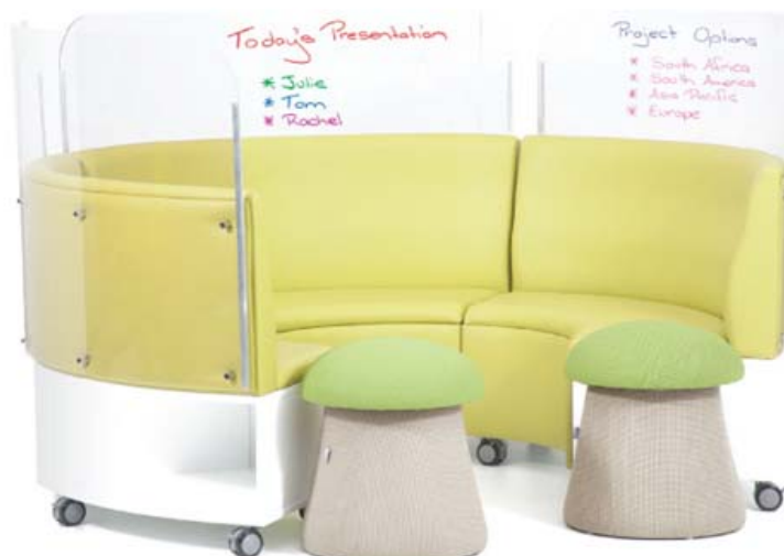
One of the sample designs to choose from