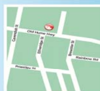
Shop 6A, 205 Old Hume Highway, Mittagong

Visit service.nsw.gov.au , call 13 77 88 or download the mobile app.